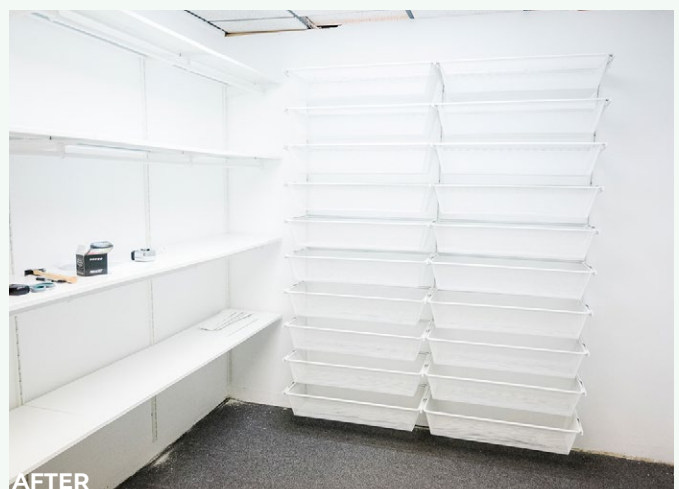
Supply closet | We have moved and updated the material services space – leveraging our expansion into Suite A and allowing for better efficiency.