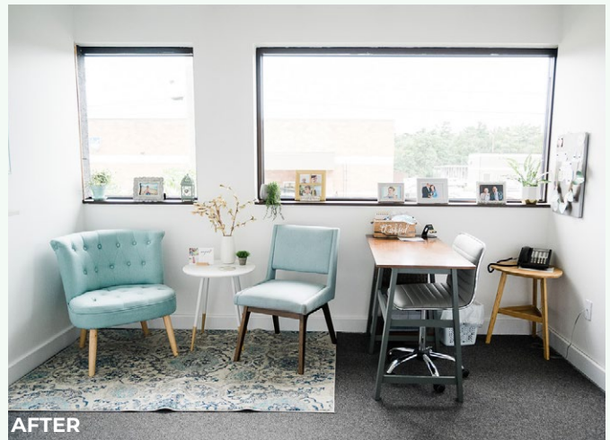
Office Update | Rhonda's office has been moved to Suite A (our new space) to make room for the additional Patient Care Room in Suite C (our current space)!